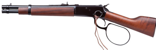
The Rossi Ranch Hand

shouldered and aimed like a rifle, and its size and shape make it a clumsy pistol. But is it still cool? Oh, yeah, off the chart cool!