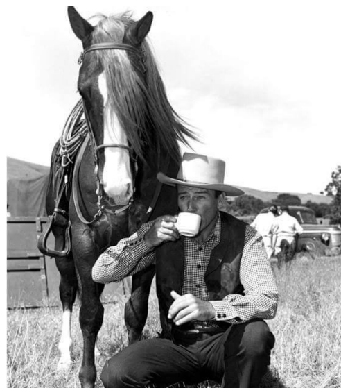
Duke, you forgot to get me some!