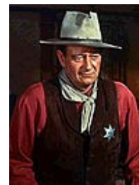
Name the Game and Bring it On!