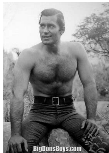
Clint Walker, May 30 1927 – May 21, 2018